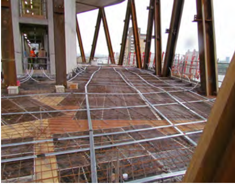
ABOVE High-strength tendons draped within a floor slab, waiting for the concrete to be poured at the Newfoundland tower, London