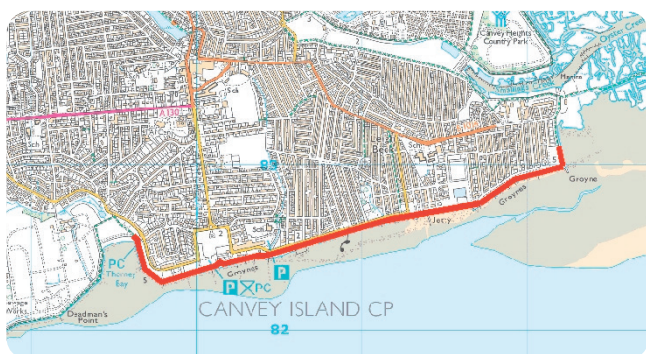
Fig. 04 Location plan with extent of Environment Agency work outlined in red

Visitors should note the risks associated with coastal environments and take necessary precautions to remain safe. Access is not permitted, under any circumstances, to the working areas of the adjacent Environment Agency construction works.