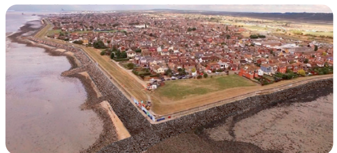
Fig. 05 Aerial photo of part of the the Canvey Island seafront