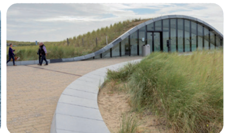
Fig.03 Kustwerk Katwijk coastal reinforcement and underground parking in the Netherlands, image courtesy of ZJA Architects

"Flooding is one of the most important climate change challenges facing the UK, and people affected by flooding are more likely to experience adverse health outcomes including long-term impacts on mental health and wellbeing"