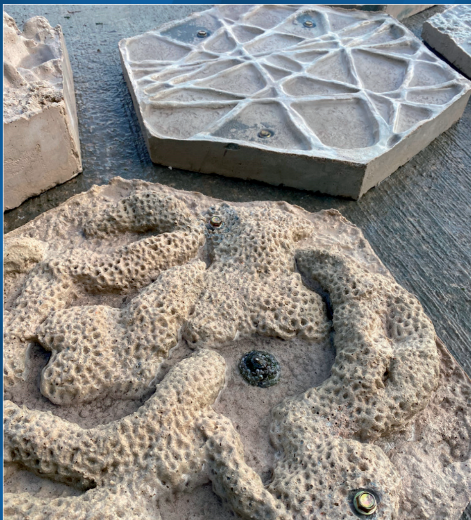
Close up of a textured concrete panel at the Settlers of Porthcawl project by Blue Cube Marine