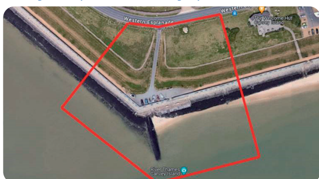
Fig. 06 Site 01 boundary outlined in red