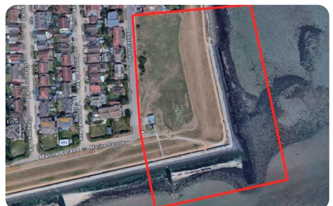
Fig. 07 Site 02 boundary outlined in red